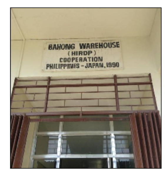
A warehouse written that "(HIRDP: Highland Integrated Rural Development Project) Cooperation Philippine-Japan, 1990"

The Bahong village people warmly welcomed the delegates with traditional songs. Following the presentations on Bahong by local government officers, a Questions & Answers session was held which provided the participants with opportunities to interact with the local officers and villagers and share